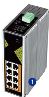
1 1000Mbps PoE Ports