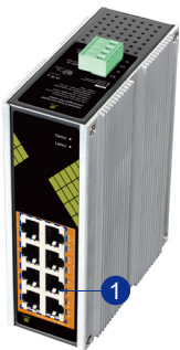
1 1000Mbps PoE Ports